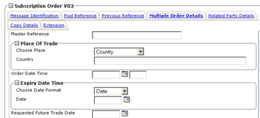
Illustration 2: Highly configurable appearance

ISB provides manual workflows for message creation, repair and authorisation as well as message checklists and other useful functionality to support the user. The visualisation of the messages is based on a highly flexible engine that is capable of displaying messages independently of their original format. The user therefore can work the same way with FIN, XML, FIX or proprietary messages and can reuse know-how. Message display and layout can be designed interactively. Fields can be moved outside the message, be rearranged and put into tables. Drop-down lists can be context sensitive. Clients appreciate this very powerful capability to help them build light business solutions for message handling.