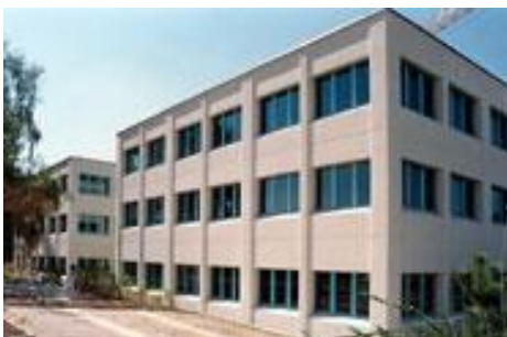
Incentage head office in Fehraltorf-Zurich