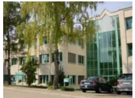
Incentage premises, Fehraltorf